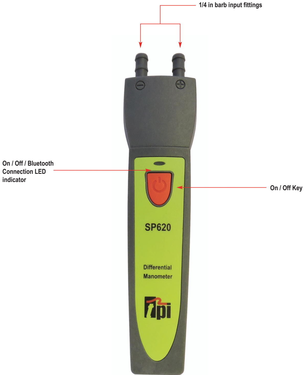
SP620 Photo Actual Size

L x W x D 6.7" x 1.5" x 0.75" 169mm x 39mm x 19mm