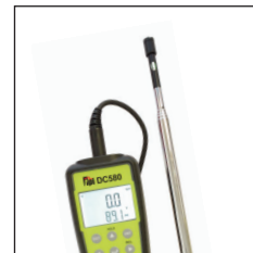
DC580C1 w/ hot-wire probe