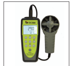
DC580C2 with vane probe