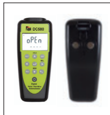
DC580 front and back