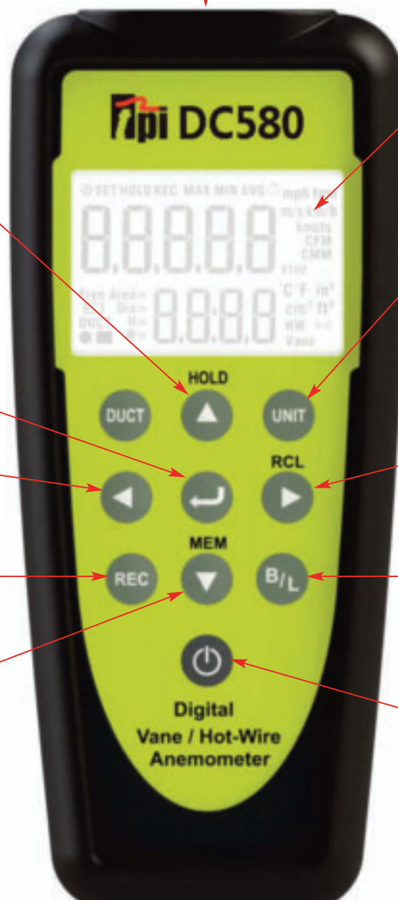
DC580 Photo Actual Size

Size W x L x D 2.9" x 6.6" x 1.6" (73.5mm x 167.5mm x 41.5mm)